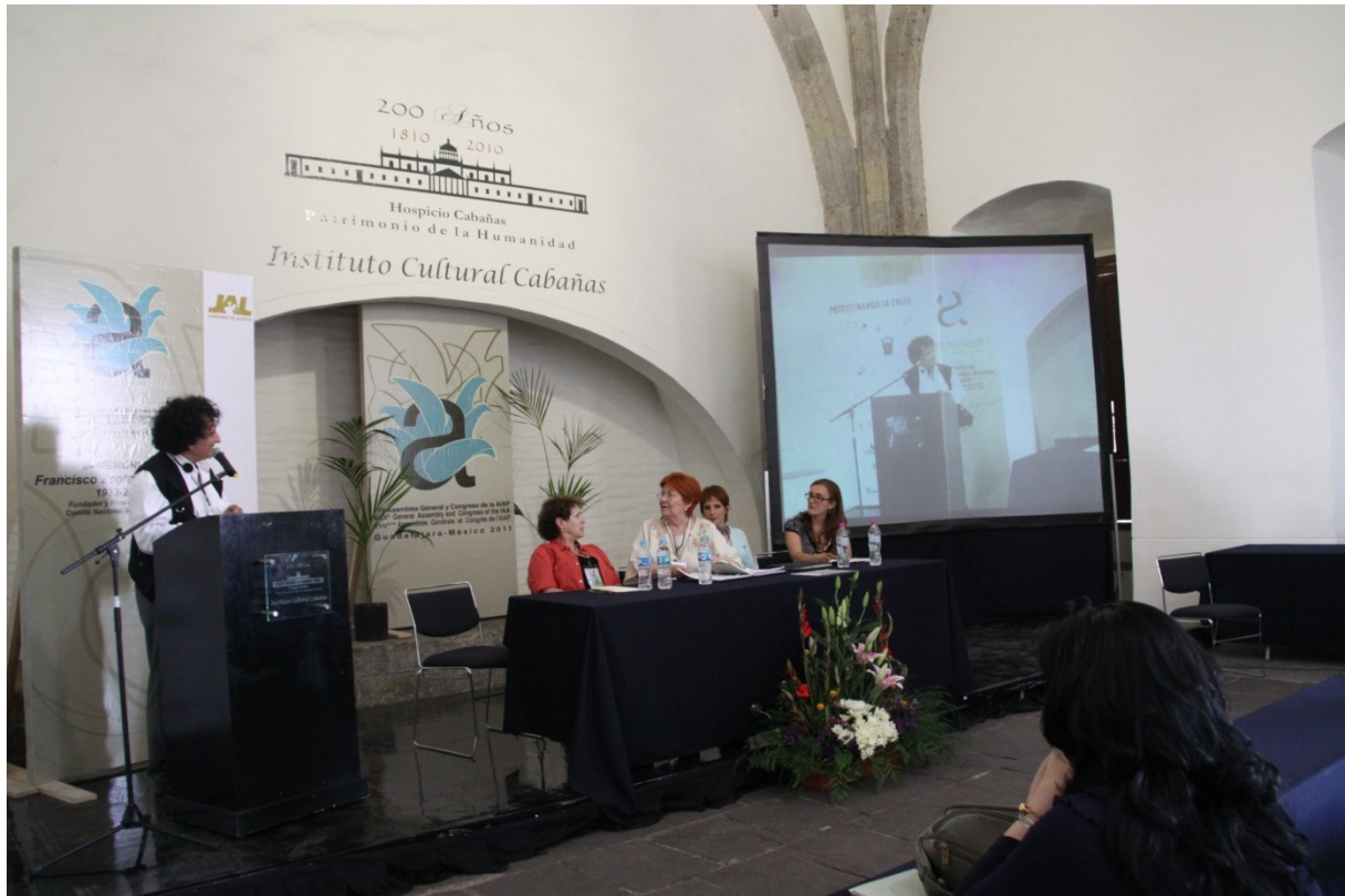
Young Artistic Activity 5 – 12 April 2011: