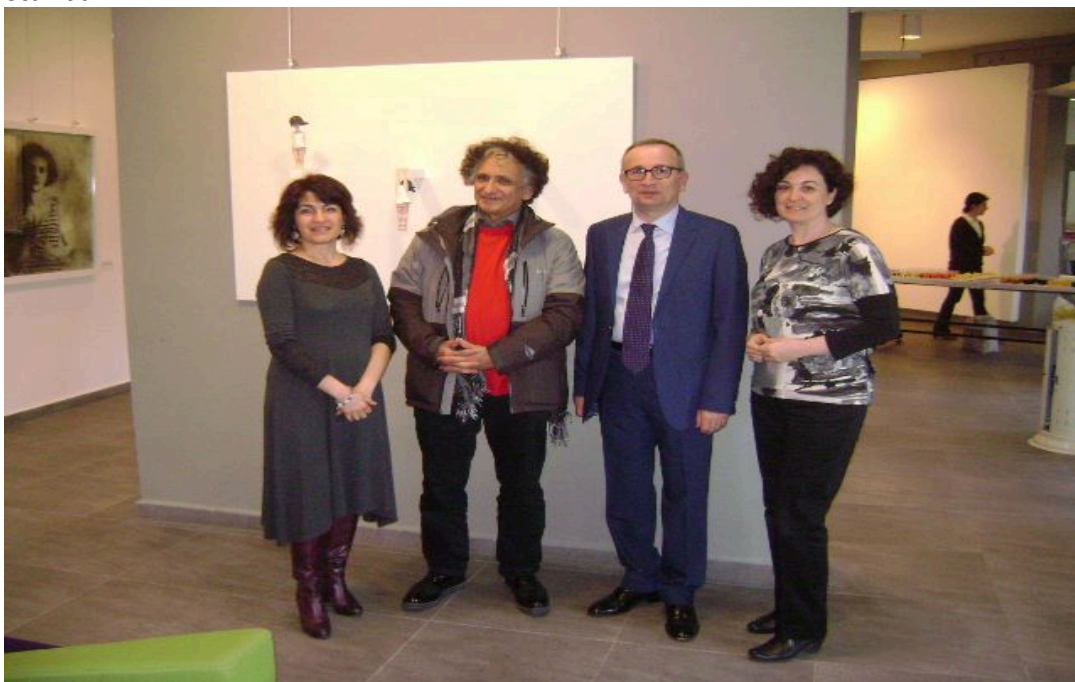
Reception of "Art for Civil Society Dialogue" exhibition

With the Workshop, Talk Sessions, Art Days Events (panel, concert, dance show) within the scope of the Project, the works produced by 12 artists were exhibited in Denizli and Istanbul.